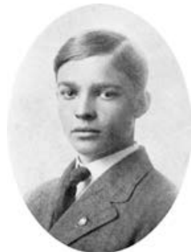
President Dwight David Eisenhower